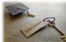
Advanced Training & Employment